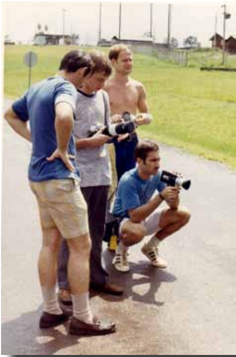
Left, The Nakon Phanom Camera Crew looks on. Anyone look familiar?