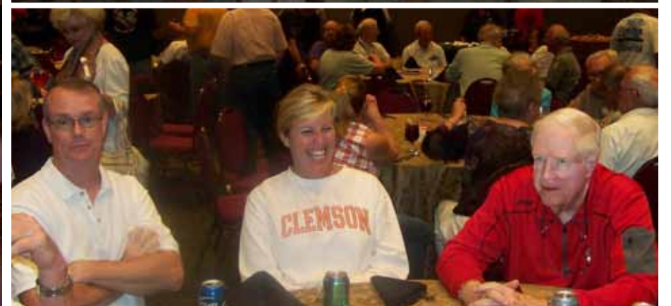
Firing Circle 7