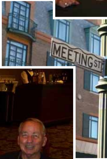
Reunion XII Charleston, SC